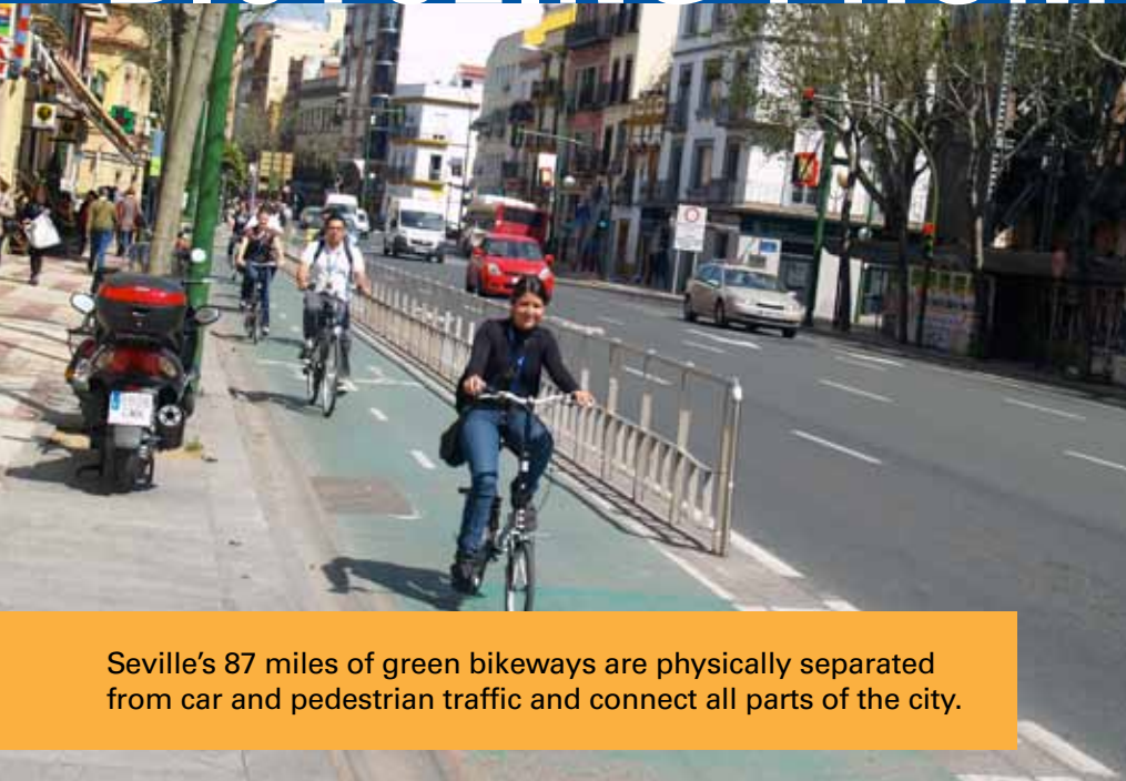
Seville's 87 miles of green bikeways are physically separated from car and pedestrian traffic and connect all parts of the city.