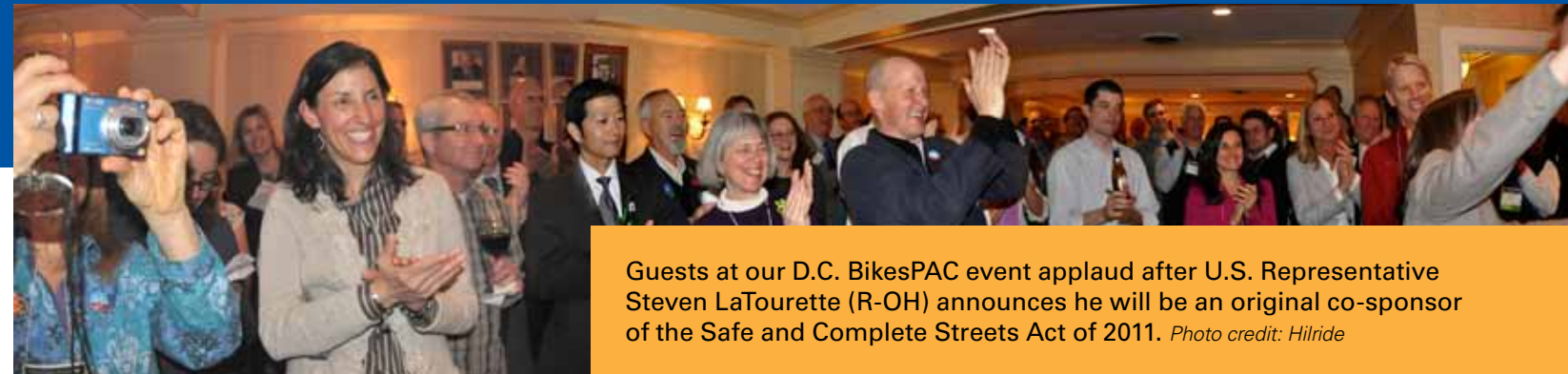
Guests at our D.C. BikesPAC event applaud after U.S. Representative Steven LaTourette (R-OH) announces he will be an original co-sponsor of the Safe and Complete Streets Act of 2011.

Longer term, we're confident that government agencies at all levels will increasingly recognize the cost-effectiveness and multiple benefits provided by investments in bicycling infrastructure and program. We believe Congress will see the value proposition and find the money necessary to support the best bike projects and programs.