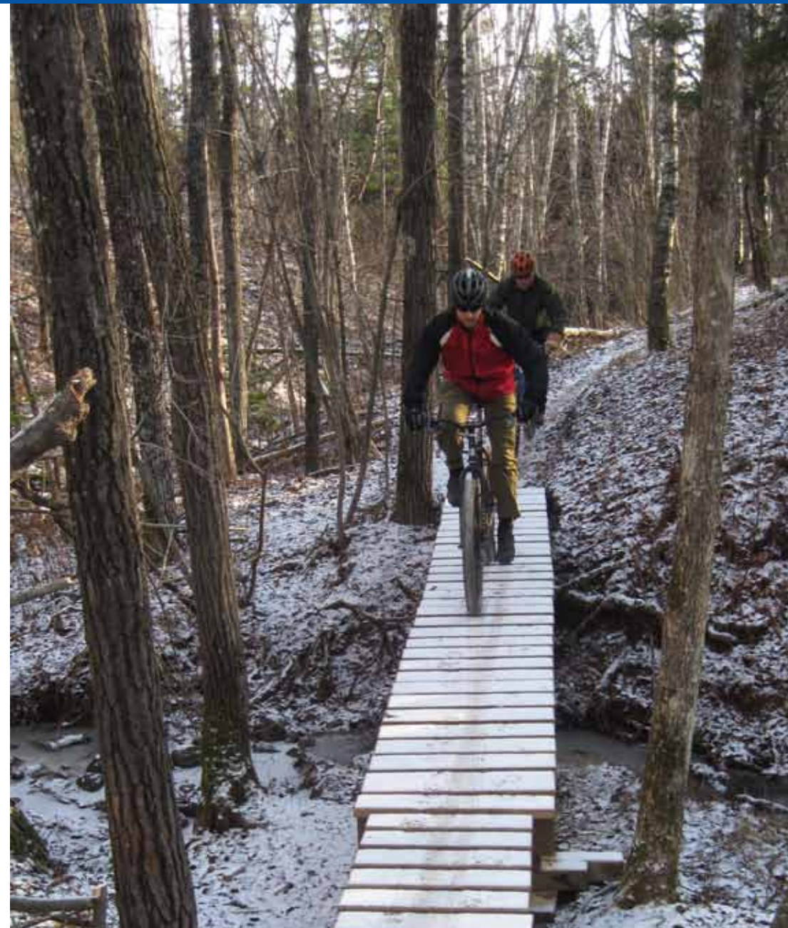
Mountain bikers in Duluth, MN ride rain, snow, or shine and will soon connect easily to all their favorite trails with the help of a $10,000 grant from Bikes Belong.

Learn more at bikesbelong.org/propurchase .