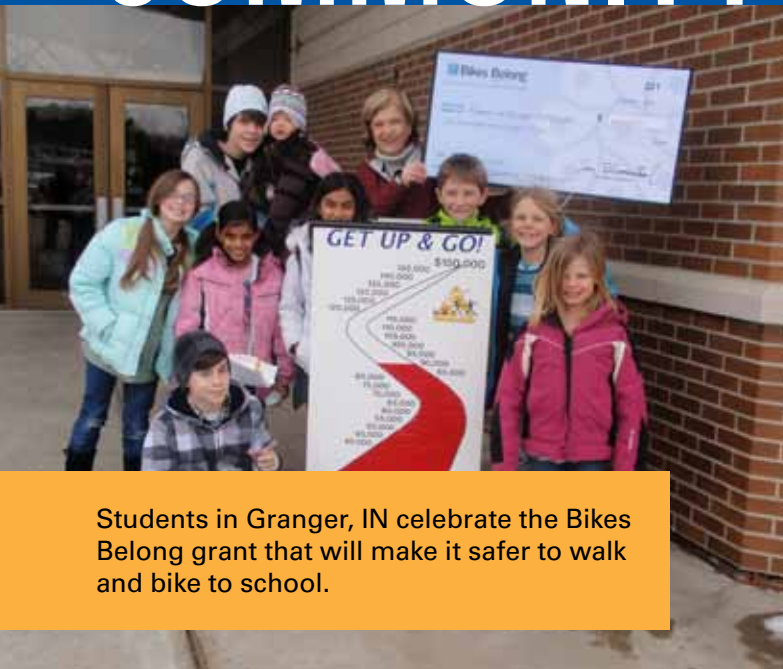
Students in Granger, IN celebrate the Bikes Belong grant that will make it safer to walk and bike to school.